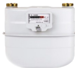
ACD G10 Y G16

-Gas type: Natural gas, air, propane, butane, nitrogen, hydrogen, and any non-corrosive gas.