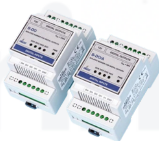
B-DO DIGITAL SIGNALS

-The intrinsically safe power supply includes reverse polarity protection, regulation via Zener diodes, and a replaceable T100 mA fuse.