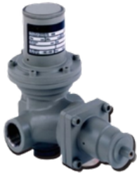
RB 1700 - 3/4"