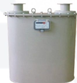
G65 Y G100

-Gas type: Natural gas, air, propane, butane, nitrogen, hydrogen, and any non-corrosive gas.