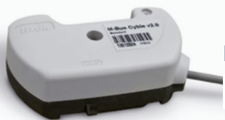
M-BUS CYBLE V2.0

-Near real-time meter data, facilitating informed decision-making.