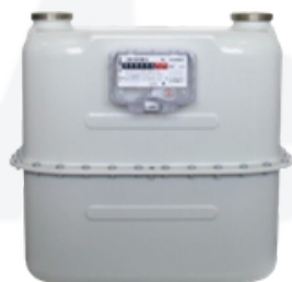
G25 Y G40

-Gas type: Natural gas, air, propane, butane, nitrogen, hydrogen, and any non-corrosive gas.