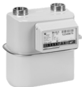
G4 Y G6

-Gas type: Natural gas, air, propane, butane, nitrogen, hydrogen, and any non-corrosive gas.