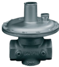
SRV 801 / 811