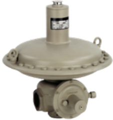
RB 1700 Y RB 1800