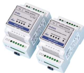
B-RS SERIAL PORTAL

-The PS-E is designed for systems powered by mains voltage ( U_m = 250\text{Vac} ). It provides a 5Vdc output voltage.