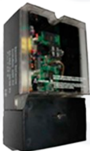
INDUBOX GSM M4

-Equipment configuration is accessed via the web page at IP address 10.10.10.10, using username and password (admin/admin).