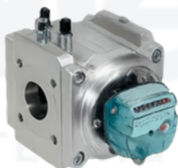
DELTA SILVER & EVO