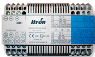
ISB + SERIAL PORTAL

-ATEX Approval: No. LCIE 07 ATEX 6083X II(1)G [Ex ia] IIC with CE