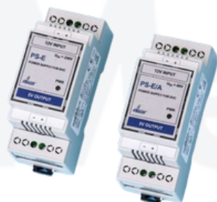
PS-E POWER SUPPLY

-The intrinsically safe power supply features reverse polarity protection, voltage and current regulation through Zener diodes, and a replaceable T100 mA fuse.