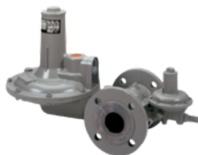
133 Y 233